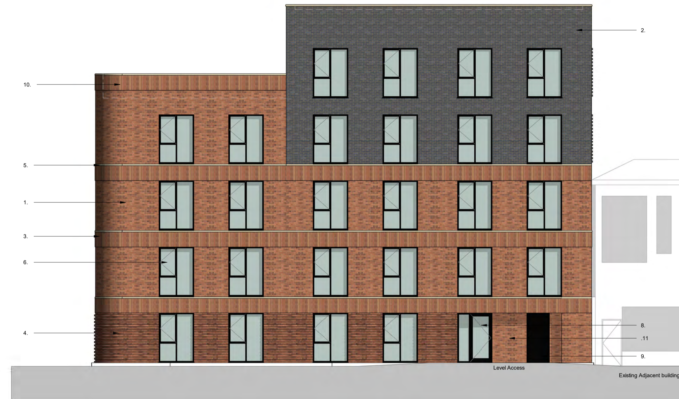
North Scale @ 1 : 100