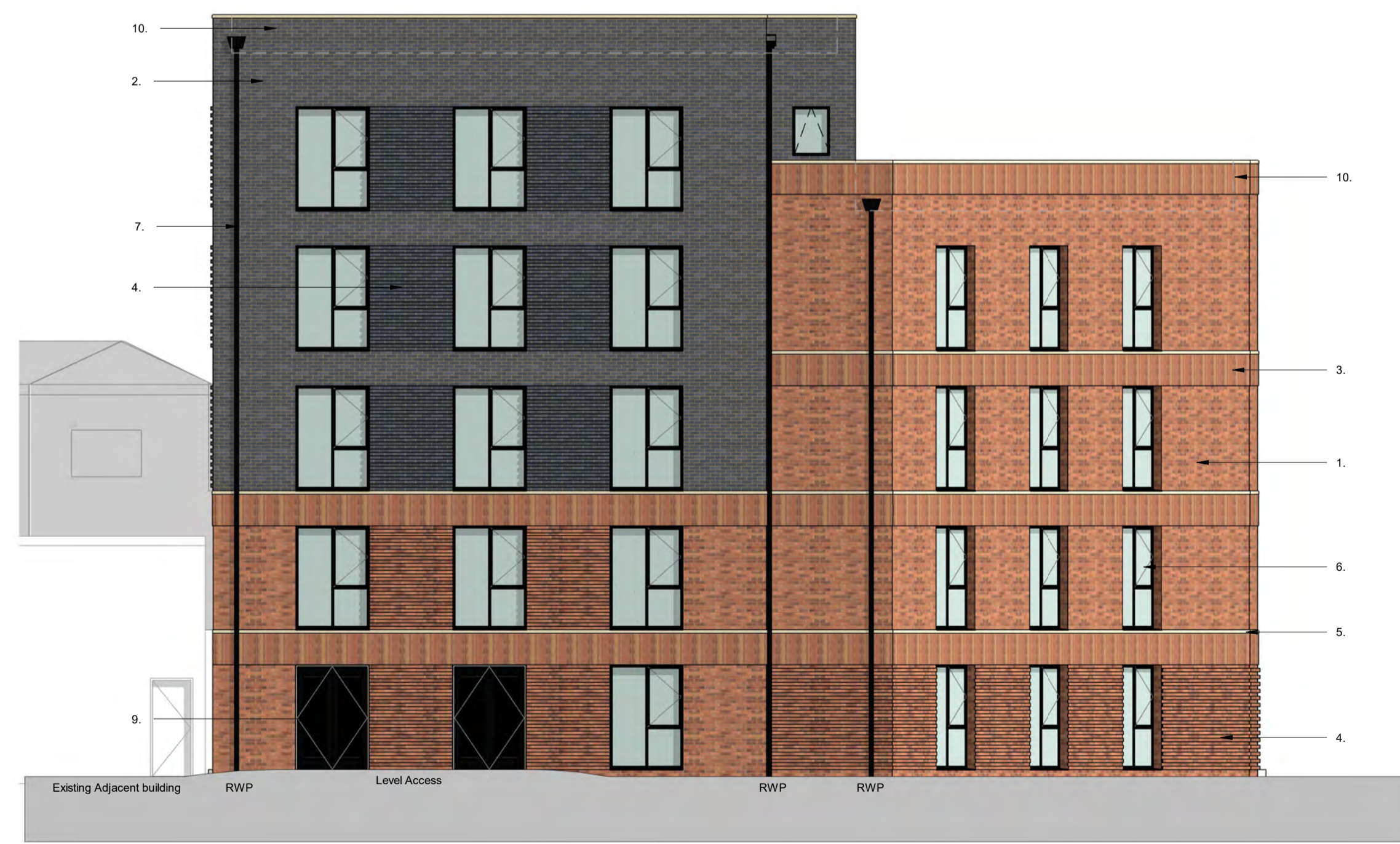
South Scale @ 1 : 100