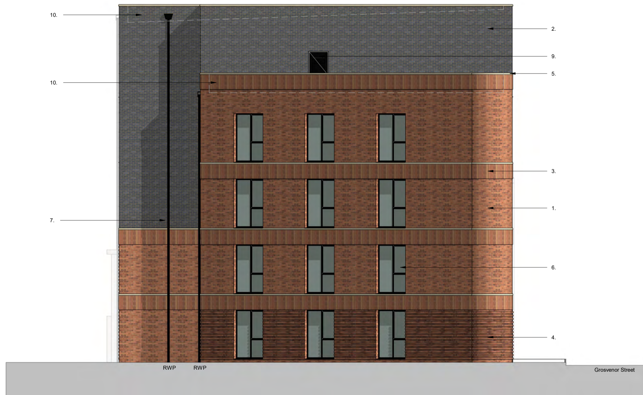
East Scale @ 1 : 100